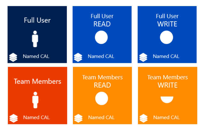
Figure 4: Full User vs. Team Members Licenses

Team Members get restricted access to the ERP Solution to complete only the following tasks: