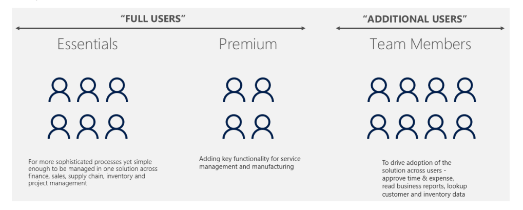
Figure 3: user Types

Full Users receive unrestricted direct or indirect access to all of the functionality in the licensed server software including setting-up, administering, and managing all parameters or functional processes across the ERP Solution. Full Users require more write capabilities that those available to Team Members.